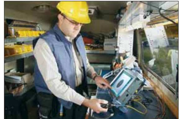
FTB-400 with FIP-USB4

Avoid these problems with the FIP-S/FIP-USB Video Fiber Inspection Probe, a handheld video microscope. Unlike traditional microscopes, the inspection probe facilitates the examination of hard-to-reach connectors on the back of patch panels and bulkhead adapters. It also lets you check the inside of connectors without taking them apart. EXFO offers two ways to achieve clear, sharp images of termination dirt and damage—a convenient handheld display, or our market-leading FTB-400 Universal Test System.