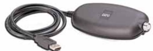
FIP-USB (USB module)