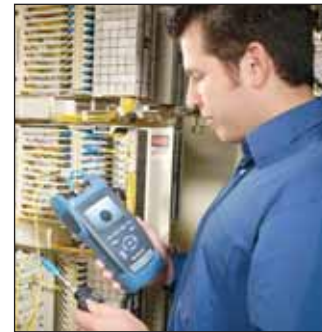
FOT-930 with P5 option

Connect the probe directly to the compact, handheld active matrix LCD screen for safe, efficient inspection. The probe's high-magnification optics project a 530-micron field of view onto the handheld's bright, high-contrast 3.5-inch TFT active matrix LCD display. The handheld display features an Auto-Shutoff interval switch with three settings to ensure long-lasting battery life.